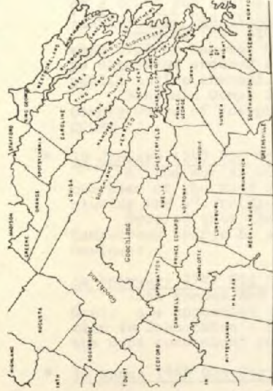
Louisa and Goshaland Counties, circa 1742