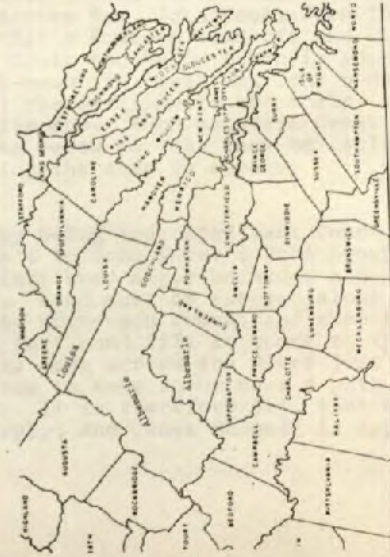
Louisa and Albemarle Counties, circa 1744