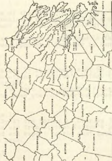
Albemarle County, circa 1746